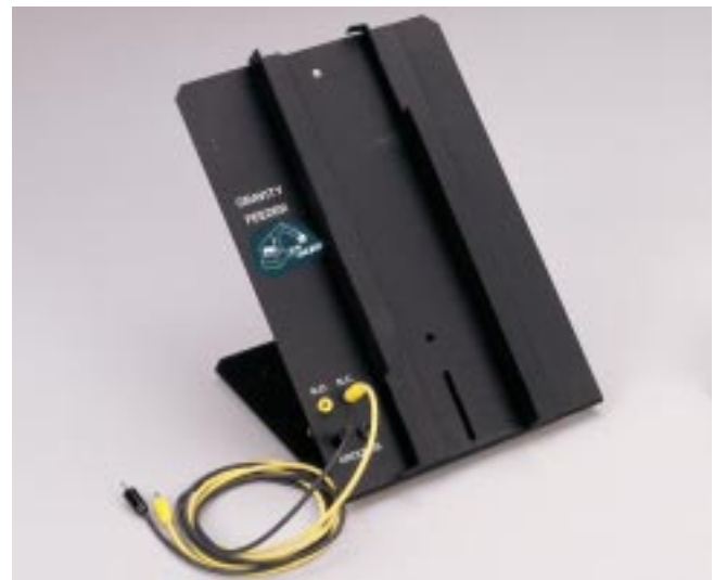
GRAVITY FEEDER (FLAT) MODEL 5119-00

The Gravity Feeder (Flat) is used in exercises that require flat stock. It has a sensor switch and feedback cables for connection to the Armdroid 1000 through the Teach Pendant 1001. Movable magnetic guideways allow for a wide range of stock sizes.