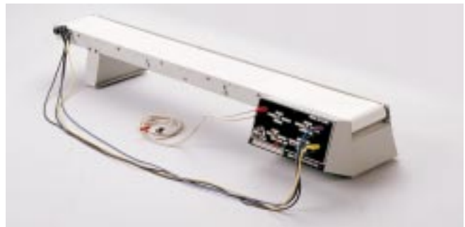
BELT CONVEYOR 1000 MODEL 5118-00

Used in material handling experiments with the Armdroid 1000 and Armdroid 2001, the conveyor has a self-contained power supply and electronic interface. The control panel has three input connectors for interfacing the conveyor with the Armdroid robots, or as a stand-alone unit. The inputs enable the motor power, stepper motor clock signal, and the direction of the belt movement to be remotely controlled. Overall dimensions are 38" x 4.5" x 5.5".