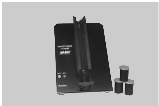
GRAVITY FEEDER (CYLINDER) MODEL 5121-00

The Gravity Feeder (Cylinder) is used in exercises that require cylindrical stock. It has a sensor switch and feedback cables for connection to the Armdroid 1000 through the Teach Pendant 1001.